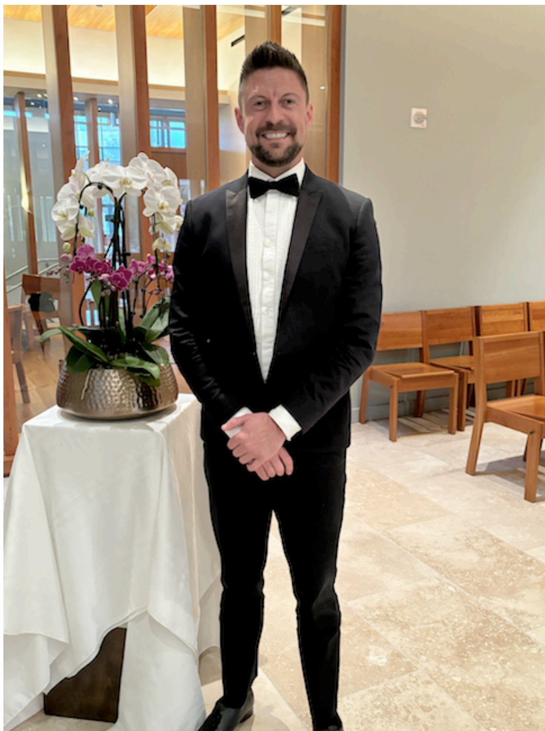
In the green room prior to the recital.