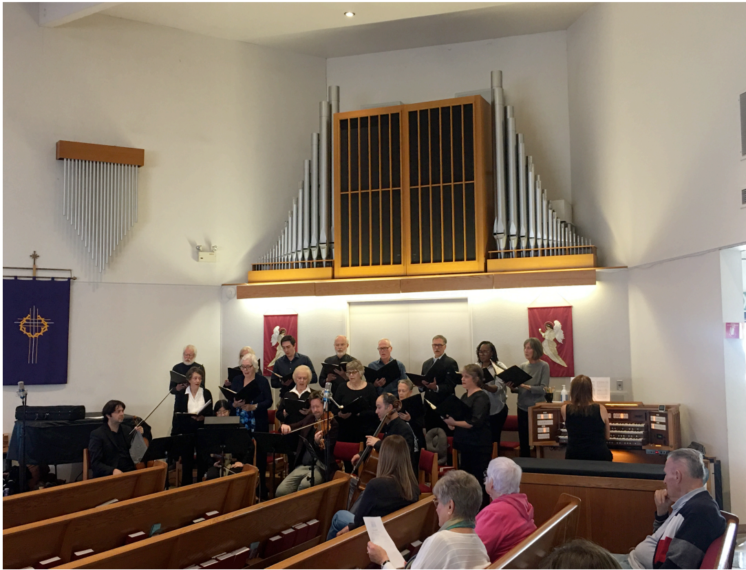
Performing Kyrie , based on the slow movement to Beethoven's seventh symphony.