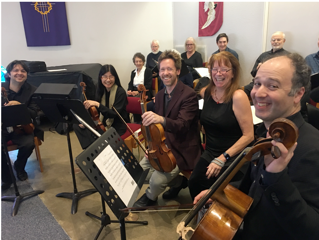
San Diego Baroque with King of Kings Choir.