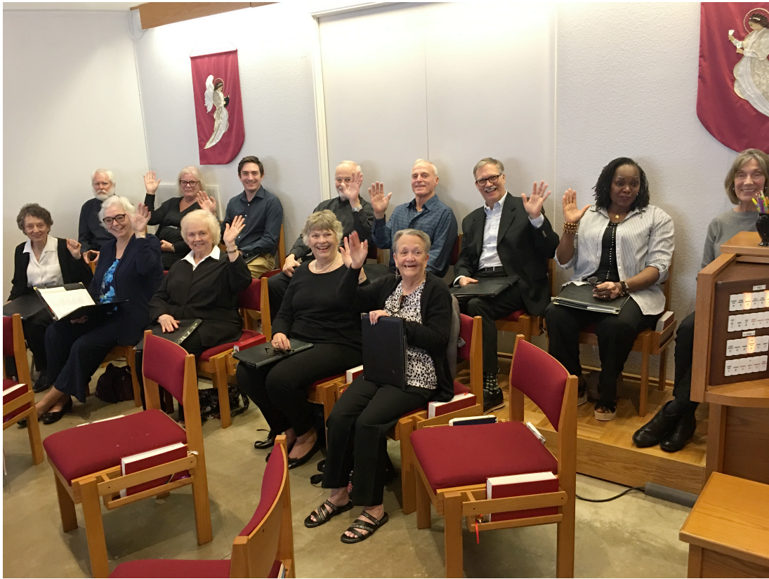
King of Kings Choir