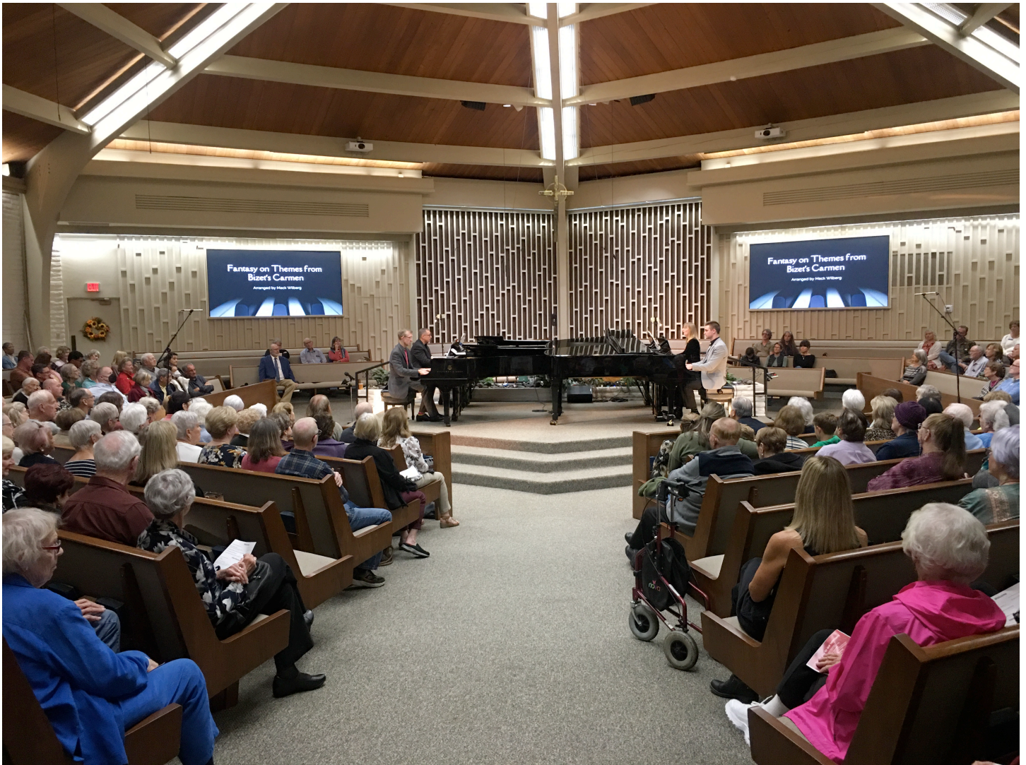
The church was packed.